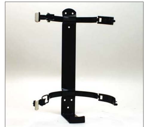
SF-024 Double Strap

Strike First also offers a Medium Duty Double Strap Vehicle Bracket for use with all 5lb and 10lb ABC fire extinguishers. Polyester powder coat finish. Heavy duty buckle closures.